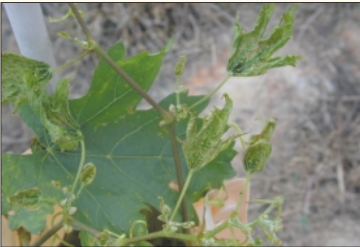
Lateral shoot growth with unusual burst of latent buds on nodes, short internodes, and distorted leaves.