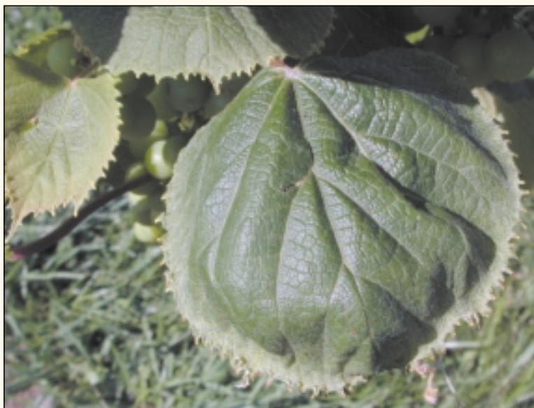
Leaf cupping downward (photo by I. Dami).