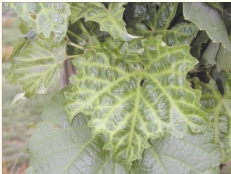
Chlorosis of leaf veins and change in leaf appearance from smooth to crinkled (photo by I. Dami).