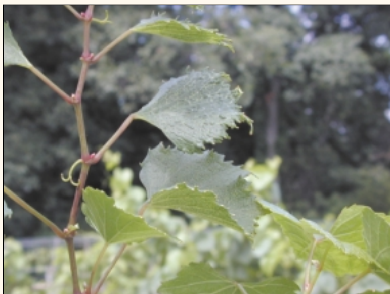
Zigzag shoot growth with shortened internodes.