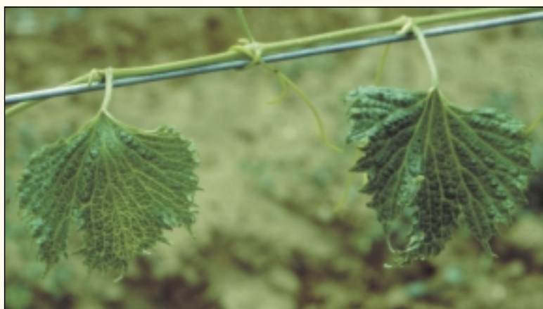
Fan-shaped leaves with small puckered spots between veins and sharp points (enations) at leaf margins.