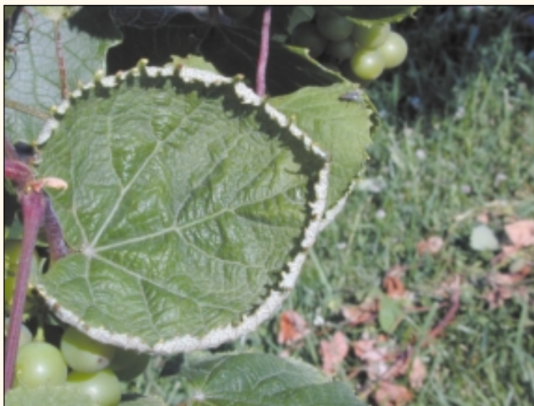
Leaf cupping upward.